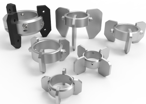
Centralizer Rings for Avian Nozzles