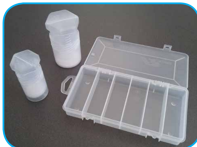
Container for inserts