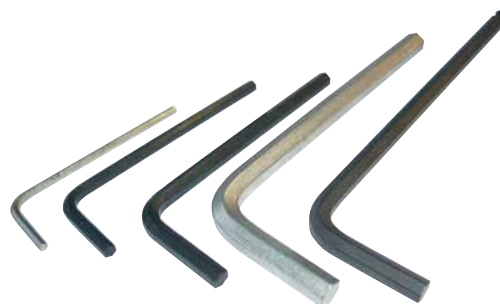
Hexagonal L keys