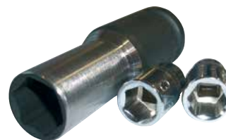
Tubular box wrench